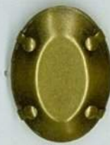
Size(mm): 18X25 Article no: CA01962