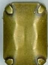
Size(mm): 18X26 Article no: CA02813