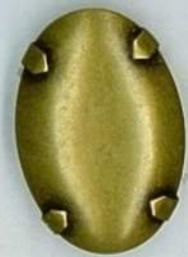
Size(mm): 21X31 Article no: CA00629