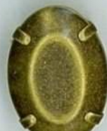
Size(mm): 18X24 Article no: CA00610