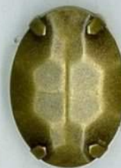
Size(mm): 21X29 Article no: CA02814